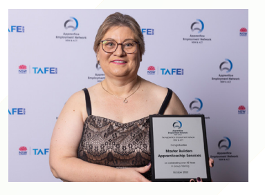
MASTER BUILDERS APPRENTICESHIP SERVICES